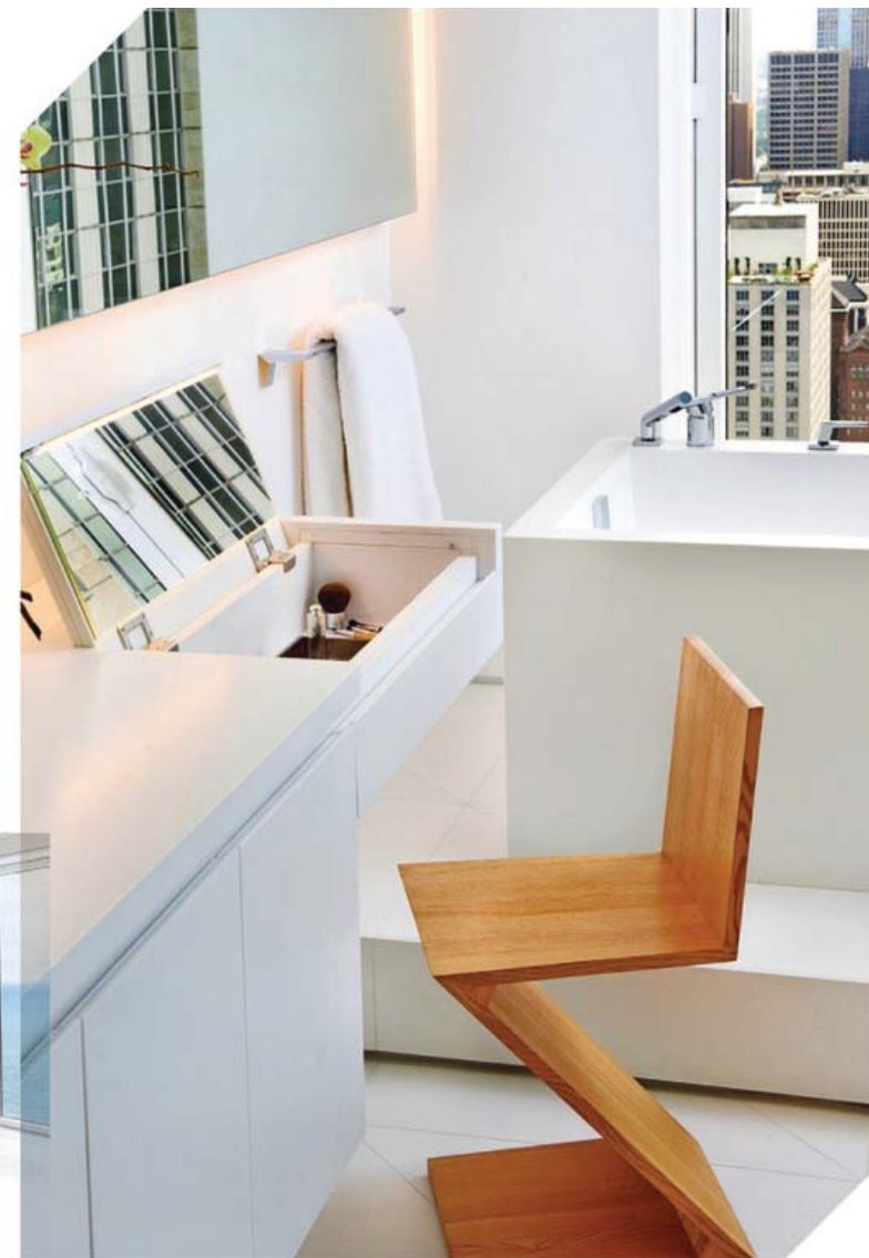
GEM SESSION Clockwise from left: The faceted design, found throughout the apartment, really takes center stage in the bar area; a natural oak zig-zag chair warms up the all-white master bath; sleek, natural wood furniture and large pieces of art—like the one in the bedroom—bring warmth to the home