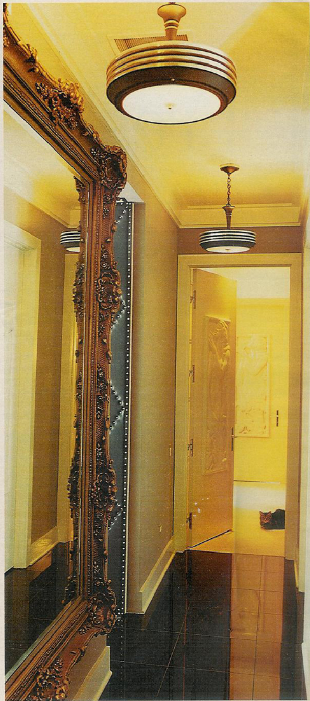
The powder room door panel was taken from a Chicago theater and reproduced in fiberglass. Inside hang old magazine covers (circa 1930s) and advertisements from nightclubs of the 1920s and '30s. Right: An antique French gilt mirror and reclaimed store fixtures from the 1930s appoint the hallway leading to the bedroom.

“WHEN I FINISH PLAYING A PARTY, I WANT TO COME HOME AND GET AWAY. YOU WALK IN HERE AND YOU ARE IN A WORLD OF GLAMOR.”